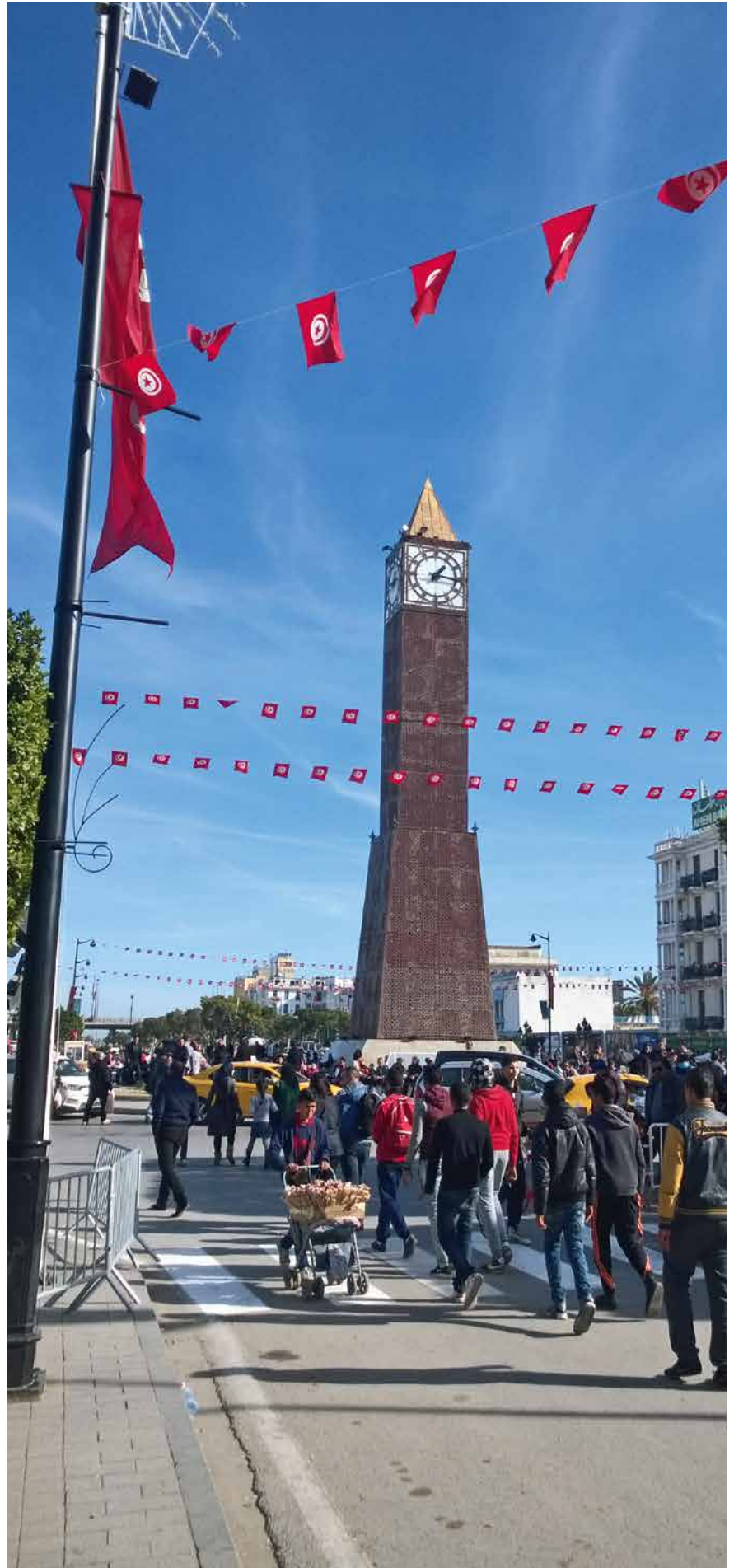
Tunis city centre on 14 January 2016: the fifth anniversary of the flight of Ben Ali, the autocrat banished to Saudi Arabia during the revolution, brought many people to the streets.

From a human geography perspective, the transnational business with health services has a number of aspects that need further consideration. These include growing inequality, macro-economic development, the role of the formal and informal economy, as well as cutting-edge biotechnology, but also questions about restrictive European border policy, international mobility and new opportunities for digitalisation. In any case, this phenomenon of globalisation, which is barely visible from a Eurocentric point of view, deserves more attention from policy and research. There are no quick and simple answers because booming private healthcare contributes, on the one hand, to increasing unequal treatment in the Tunisian healthcare system, but is vital, on the other hand, for patients – and of increasing importance for the Tunisian economy. At least the development processes set in motion are entirely African rather than the result of paternalistic European development cooperation. ●