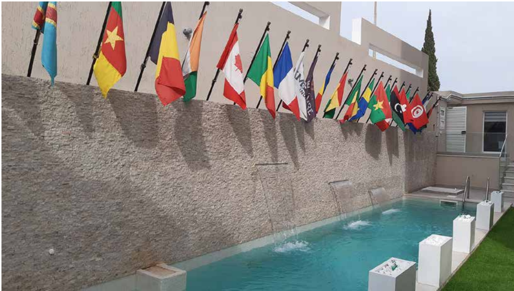
Courtyard of a nursing home and rehabilitation centre for an international clientèle in Tunis.