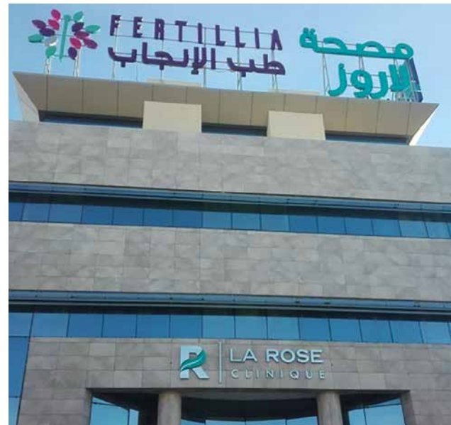
Private clinics in Tunisia, such as this hospital with an emergency room in Djerba (left) or the fertility centre in Tunis (right), are popular among foreign patients.

society and an extremely lively and critical art and cultural scene have developed in Tunisia. The economic situation, however, remains tense. The lack of economic prospects, especially for young people, and persistent corruption are once again bringing the question of dignity to the fore.